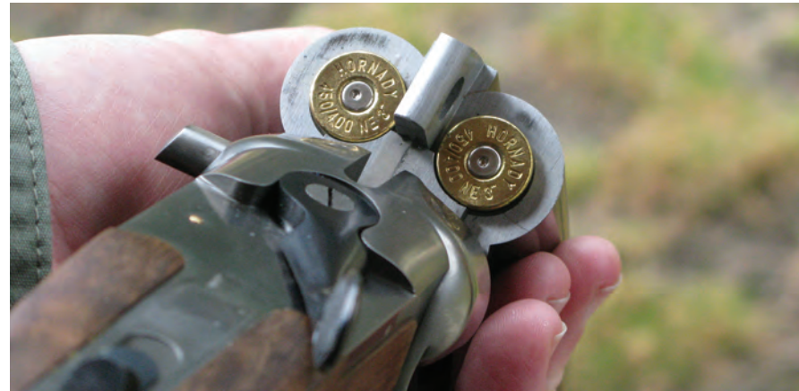
The availability of factory-loaded ammunition from Hornady for double rifle calibers such as the .450/400 3-inch has made it easier to own a double rifle in recent years.